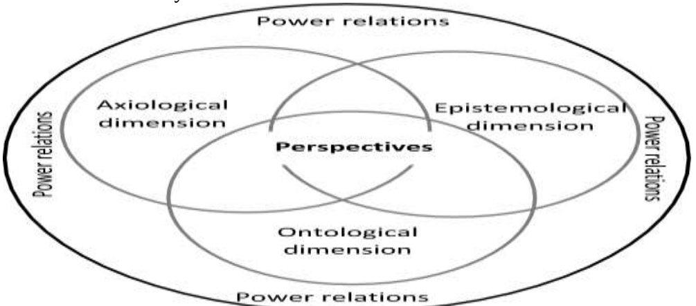
Fig 1: Coloniality diagram. This diagram illustrates the different dimensions of coloniality. The overlapping area represents the perspectives present in all dimensions: the dominant and non-dominant perspectives.

aid in the formulation of more advanced approaches to address the intricate socio-economic, political, and cultural challenges in the region. As we explore the complexities of post-colonial discourse in the Middle East, we must confront the challenge of examining the enduring effects of colonialism, while recognizing the resilience, creativity, and aspirations of communities endeavoring to reclaim their narratives and determine their own futures in a world influenced by colonialism.